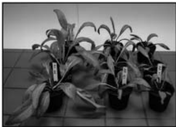
Fig. 1. Effect of NaCl on the growth of Aster tripolium plants cultivated with different salt concentrations. Aster plants watered with 0 mM, 258 mM, and 517 mM NaCl in the watering solution (from the left to the right) for up to 10 d. Conditions in the greenhouse were a 16 h light/8 h dark rhythm at temperatures of 23 °C/21 °C and humidity of 55%. The plants showed decreased growth rates with increasing salt concentrations.

The fatty acid profiles of SQDG from Aster and Sesuvium were analysed by means of GC-MS. Sesuvium and Aster were grown for 7 and 10 d, respectively, with and without salt as described in Material and Methods. The results of the fatty acid composition of SQDG are summarized in Table I. SQDG contained predominantly 16:0 (palmitic acid) and 18:3 (γ-linolenic acid), and trace amounts of 18:2 (linoleic acid). In Aster the degree of unsaturation slightly decreased after 1 d of salt treatment in comparison to control plants based on 18:3 and 18:2 species. During longer salt treatment (10 d) the degree of unsaturation slightly increased having less 16:0 and almost two-fold 18:2 species in comparison to the controls. In Sesuvium after 7 d of salt treatment the 18:2 species clearly increased in comparison to the control in a similar